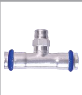
Branch Tee Male