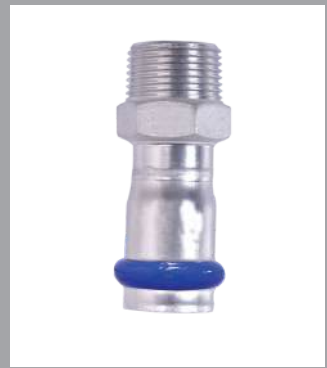
Male Thread Socket