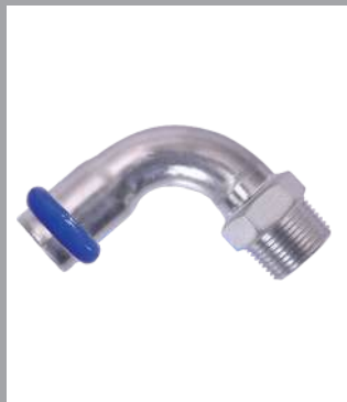
90° Male Elbow