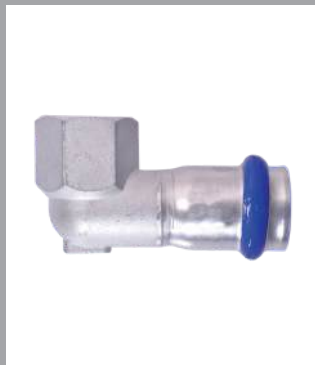
90° Female Elbow (Short)