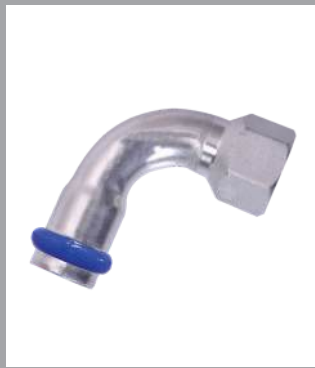
90° Female Elbow