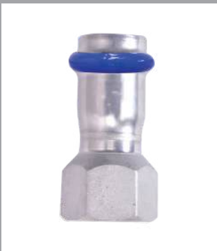
Female Thread Socket